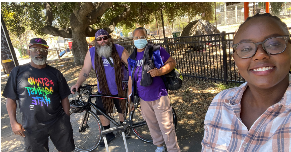
WORLD Vaccine Access outreach team

I got mine, you got yours? Find out where to get vaccinated in Oakland by visiting our website or following us on social media.